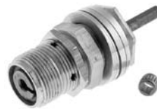
Direct Drive Cam Adapter Part No. 1388