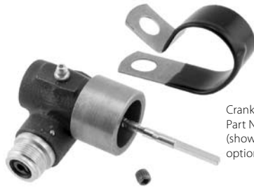
Crankshaft Adapter Part No. 1386 (shown with optional clamp)

If your engine doesn't lend itself to driving a tach from the cam or distributor, then this quality 2:1 reduction gearbox may be the answer. It is designed to mount in front of the crankshaft. Just drill a 9/32" hole in the end of the crankshaft or in the head of the crankshaft front bolt to accept the drive bushing. A short flex cable with square ends transmits the rotation to the gearbox while allowing a reasonable amount of misalignment.