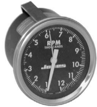
Jones 3 inch Mechanical Tachometer Part No. 1370-12-4:1

The adapter can be rotated to allow the cable to approach from any direction perpendicular to the tach input.