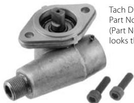
Tach Drive Gearbox Part No. 166-20 (Part No. 176-20 looks the same)

This gearbox provides 2:1 speed reduction. Since it is driven by the cam or oil pump which is already turning at 1/2 crank speed, the cable actually turns at 1/4 crank speed. Therefore, a 4:1 tach must be used with this type of gearbox.