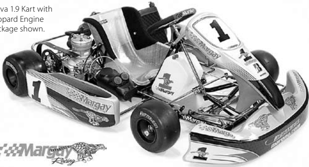
Brava 1.9 Kart with Leopard Engine Package shown.

Margay, now in its 45th year and 3rd generation, is the most experienced manufacturer of racing karts in the USA. Margay karts are designed and built in the United States specifically for U.S. kart tracks and for the various classes currently competing in the U.S. You won't find a better kart out of the box or on the track, whether it's a TaG (Touch and Go) package, traditional Yamaha kart, or a Briggs kart. Year in and year out, Margay's winning record speaks for itself. Margay has won the prestigious WKA Manufacturer's Cup Championship 6 years in a row. In fact, Margay has claimed 13 WKA Championships since the mid 1990's! The key to Margay's long-term success in the evolving U.S. karting market is this: Margay lives here, designs here, builds here, races here and wins here. Pegasus has teamed up with Margay to add our unmatched customer service to the equation, making Margay a truly unbeatable choice!