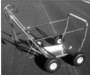
Below: Pro KartLift Part No. 9983-200

Truly a one person solution to lifting your kart in the shop or at the track. Enjoy the benefits of being able to "go it alone" by using KartLift stands. Great for loading karts in and out of pickup truck beds or trailers without ramp doors. The Titan KartLift uses gas struts to take the weight of your kart off your hands, making lifting the kart much easier. A manual safety release requires that you support part of the weight of the kart with one hand while lowering it, so this unit is recommended for karts weighing less than 200 pounds and operators who weigh at least as much as their karts. Your body weight pushes down on the gas struts to collapse the lift, so this lift requires an operator weighing at least 120 pounds. The Pro KartLift is designed for karts weighing up to 60 lbs more than the operator. A foot lever releases the safety catch while lowering the stand, allowing a lighter operator to use both hands while lowering a heavier kart. The Electric KartLift raises and lowers your kart effortlessly with the simple push of a button! It is recommended for heavier karts (up to 400 lbs!), particularly where the kart outweighs the operator by 60 lbs or more. The Titan features a durable black powder coated finish. The Pro and Electric lifts both feature an attractive silver powder coat finish and a lower tool tray for starter, helmet, etc. The Electric KartLift includes the battery and charger.