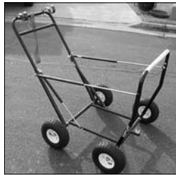
Above: Titan KartLift Part No. 9983-201