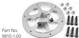
Part No. 9810-1.00