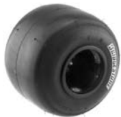
Bridgestone Dry Tires for race karts