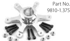
Part No. 9810-1.375

Machined from billet aluminum, Premier Sprocket Hubs are lightweight and durable. Their low rotational inertia allows faster acceleration and quicker clutch engagement. Available for 1.00", 1.25", 1.375", and 40mm axles.