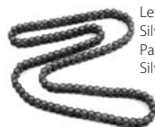
Left: EK #219 Silver Pro Chain Part No. 9817-Silver-114