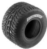
Bridgestone Wet Tires for race karts