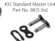
#35 Standard Master Link Part No. 9815-Std