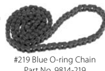
#219 Blue O-ring Chain Part No. 9814-219