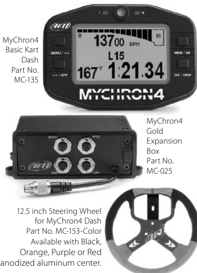
MyChron4 Basic Kart Dash Part No. MC-135

Steering Wheel for MyChron4 . . . Pt. No. MC-153-Color . $148.99