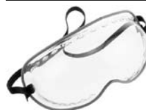
Vented Bubble Goggles Part No. 2264