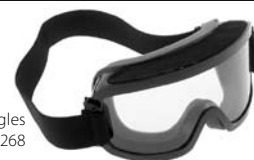
Large Goggles Part No. 2268

Vented Bubble Goggles ..... Part No. 2264 ..... $9.99 Large Goggles ..... Part No. 2268 ..... $33.99 For drivers who wear glasses. These goggles feature a replaceable clear lens.