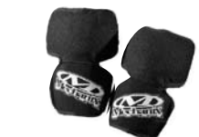
Above: Mechanix Knee Pads Part No. 3736