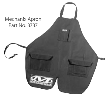
Mechanix Apron Part No. 3737

Kevlar® Sleeves . . . . . Part No. 3735 . . . . . $17.99