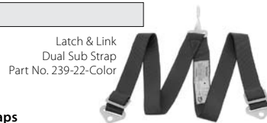
Latch & Link Dual Sub Strap Part No. 239-22-Color