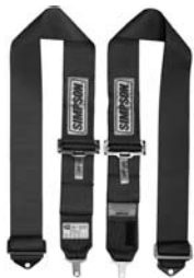
Camlock Separate Shoulder Harness Part No. 237-30-Color

We stock many more versions of Simpson harnesses than we can show here. Please call or visit our website for more options!