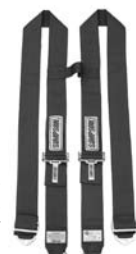
Latch & Link H-Type Shoulder Harness Part No. 239-32-Color