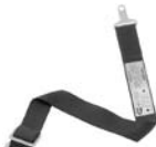
Camlock Single Sub Strap Part No. 237-21-Color

These straps help hold the lap belt buckle in the correct position for maximum protection. Just like the shoulder harnesses described above, these straps are equipped for bolt-in mounting but can be converted to snap-in or wrap-around mount. Length is set when the strap is installed except on the adjustable versions, which have quick-adjust sliders for on-the-fly adjustments, as in multiple-driver cars. All use 1.75" wide webbing.