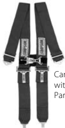
Camlock Shoulder Harness with Sternum Latch Part No. 237-35-Color

Some sanctioning organizations may not allow the use of Shoulder Harnesses with a Sternum Latch. If in doubt, check your rule book or ask a tech inspector before ordering.