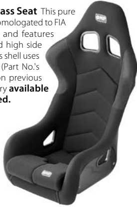
OMP WRC Fiberglass Seat Part No. 3451-Color .....$759.00

OMP WRC Fiberglass Seat This pure competition seat is homologated to FIA Standard 8855-1999 and features five harness slots and high side bolsters. The fiberglass shell uses side-mount brackets (Part No.'s 3456 or 3459), sold on previous page. Cloth upholstery available in Black, Blue or Red.