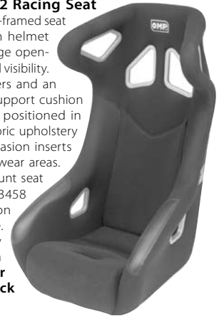
OMP Record 2 Tube Frame Seat Part No. 3454-706-Color ..... $639.00

This tubular steel-framed seat boasts a built-in helmet support with large openings for enhanced visibility. High side bolsters and an adjustable leg support cushion keep you firmly positioned in the seat. The fabric upholstery features anti-abrasion inserts sewn into high wear areas. This bottom mount seat uses Part No. 3458 brackets sold on the previous page. Cloth upholstery is available in Black, Blue, or Red with Black Center.