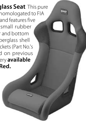
OMP Grip Fiberglass Seat Part No. 3454-688-Color ..... $639.00

OMP Grip Fiberglass Seat This pure competition seat is homologated to FIA Standard 8855-1999 and features five harness slots and small rubber dots in the shoulder and bottom for traction. The fiberglass shell uses side-mount brackets (Part No.'s 3456 or 3459), sold on previous page. Cloth upholstery available in Black, Blue or Red.