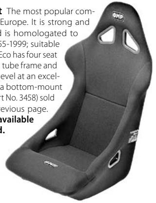
OMP Eco Tube Frame Seat Part No. 3450-Color ..... $399.00

OMP Eco Seat The most popular competition seat in Europe. It is strong and lightweight and is homologated to FIA Standard 8855-1999; suitable for road use too! Eco has four seat belt holes, a steel tube frame and a great comfort level at an excellent price. This is a bottom-mount seat; brackets (Part No. 3458) sold separately on previous page. Cloth upholstery available in Black or Red.