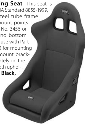
OMP TRS Tube Frame Seat Part No. 3454-741-Color ..... $369.00

OMP TRS Racing Seat This seat is homologated to FIA Standard 8855-1999, and features a steel tube frame with both side mount points (for use with Part No. 3456 or 3459 brackets) and bottom mount points (for use with Part No. 3458 brackets) for mounting flexibility. Seat mount brackets are sold separately on the previous page. Cloth upholstery available in Black, Blue, or Red.