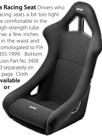
OMP Extra Tube Frame Seat Part No. 3454-634-Color ..... $499.00

OMP Extra Racing Seat Drivers who find other racing seats a bit too tight may be more comfortable in the Extra. This high-strength tube frame seat has a few inches more room in the waist and hip areas. Homologated to FIA Standard 8855-1999. Bottom mount seat, uses Part No. 3458 brackets sold separately on the previous page. Cloth upholstery available in Black or Red.