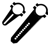
Short Bracket (Top) Long Bracket (Bottom)

This easy-to-install convex interior mirror mounts to your roll bar with a clamp-on bracket at each end. The 0.5"-2.5" bracket is slotted, allowing easy adjustment. The 2.0"-5.5" bracket is drilled for ten different positions. Kit includes 2 clamp-on brackets and one mirror. "Mirror only" in chart below does not include hardware.