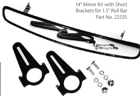
14" Mirror Kit with Short Brackets for 1.5" Roll Bar Part No. 22535