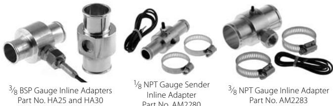
3/8 BSP Gauge Inline Adapters Part No. HA25 and HA30