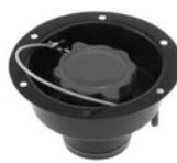
Recessed Fender Filler Part No. 2515