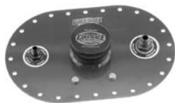
Standard Fill Plate Part No. 2519