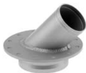
45° Remote Fill Valve Part No. 2514