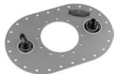
Remote Fill Plate Part No. 2510