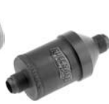
Discriminator Valve Part No. FS DV100