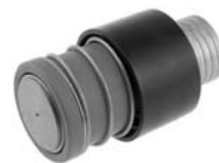
Male Dry Break Part No. 2531