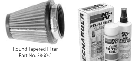
Round Tapered Filter Part No. 3860-2