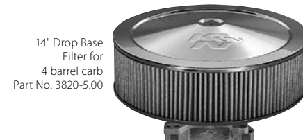
14" Drop Base Filter for 4 barrel carb Part No. 3820-5.00