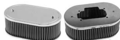
Filter Assembly for Weber 32/36 DGV Part No. 3813-3.25 Top and bottom view shown (sold individually)