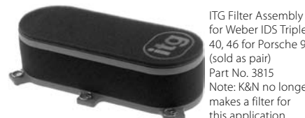
ITG Filter Assembly for Weber IDS Triple 40, 46 for Porsche 911 (sold as pair) Part No. 3815 Note: K&N no longer makes a filter for this application.