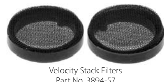
Velocity Stack Filters Part No. 3894-57