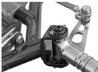
Detail of Merlin front spindle adjuster