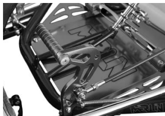
Detail of Merlin brake pedal