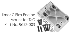
Ilmor C-Flex Engine Mount for TaG Part No. 9652-003