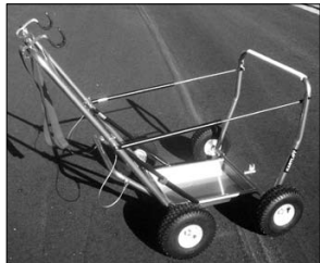
Pro KartLift Part No. 9983-200

Truly a one person solution to lifting your kart in the shop or at the track. Enjoy the benefits of being able to "go it alone" by using KartLift stands. Great for loading karts in and out of pickup truck beds or trailers without ramp doors. The Titan KartLift uses gas struts to take the weight of your kart off your hands, making lifting the kart much easier. A manual safety release requires that you support part of the weight of the kart with one hand while lowering it, so this unit is recommended for karts weighing less than 200 pounds and operators who weigh at least as much as their karts. Your body weight pushes down on the gas struts to collapse the lift, so this lift requires an operator weighing at least 120 pounds. The Pro KartLift is designed for karts weighing up to 60 lbs more than the operator. A foot lever releases the safety catch while lowering the stand, allowing a lighter operator to use both hands while lowering a heavier kart. The Electric KartLift raises and lowers your kart effortlessly with the simple push of a button! It is recommended for heavier karts (up to 400 lbs!), particularly where the kart outweighs the operator by 60 lbs or more. The Titan features a durable black powder coated finish. The Pro and Electric lifts both feature an attractive silver powder coat finish and a lower tool tray for starter, helmet, etc. The Electric KartLift includes the battery and charger.