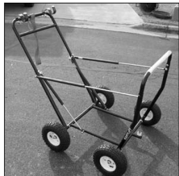
Titan KartLift Part No. 9983-201