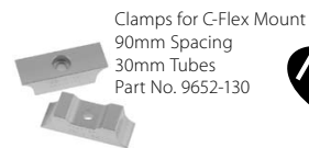
Clamps for C-Flex Mount 90mm Spacing 30mm Tubes Part No. 9652-130