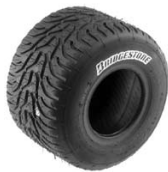
Bridgestone Wet Tires for race karts