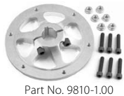
Part No. 9810-1.00