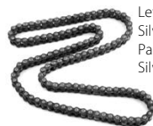
Left: EK #219 Silver Pro Chain Part No. 9817-Silver-114