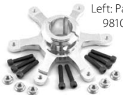
Left: Part No. 9810-1.375