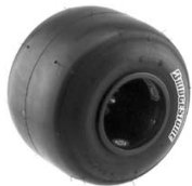
Bridgestone Dry Tires for race karts