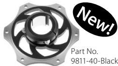
Part No. 9811-40-Black

Machined from billet aluminum, Premier Sprocket Hubs are lightweight and durable. Their low rotational inertia allows faster acceleration and quicker clutch engagement. Available for 1.00", 1.25", 1.375", and 40mm axles.