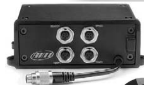
MyChron4 Gold Expansion Box Part No. MC-025

12.5 inch Steering Wheel for MyChron4 Dash Part No. MC-153-Color Available with Black, Orange, Purple or Red anodized aluminum center.