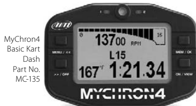
MyChron4 Basic Kart Dash Part No. MC-135

Steering Wheel for MyChron4 ...Pt. No. MC-153-Color..$148.99