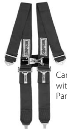
Camlock Shoulder Harness with Sternum Latch Part No. 237-35-Color

Some sanctioning organizations may not allow the use of Shoulder Harnesses with a Sternum Latch. If in doubt, check your rule book or ask a tech inspector before ordering.