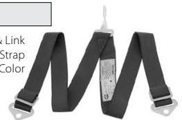
Latch & Link Dual Sub Strap Part No. 239-22-Color