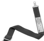
Camlock Single Sub Strap Part No. 237-21-Color

These straps help hold the lap belt buckle in the correct position for maximum protection. Just like the shoulder harnesses described above, these straps are equipped for bolt-in mounting but can be converted to snap-in or wrap-around mount. Length is set when the strap is installed except on the adjustable versions, which have quick-adjust sliders for on-the-fly adjustments, as in multiple-driver cars. All use 1.75" wide webbing.