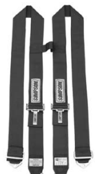
Latch & Link H-Type Shoulder Harness Part No. 239-32-Color