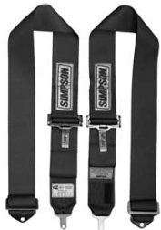
Camlock Separate Shoulder Harness Part No. 237-30-Color

We stock many more versions of Simpson harnesses than we can show here. Please call or visit our website for more options, including 2" shoulder straps for HANS®!