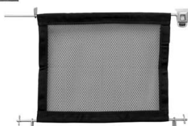
Right: Mesh Type Window Net Part No. 2310-Color, shown with Mounting Rod Kits, Part No.'s 2304-Top and 2304-Bottom (all sold separately)

SFI 27.1 Window Nets These rectangular nets fit most sedans. Loops at top and bottom fit 7/16" mounting rods.