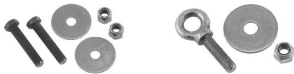
Bolt-in Hardware Kit Part No. 2383 Eyebolt Hardware Kit Part No. 2384

These items may come in handy when installing your harness or when converting a wrap-around mount to a bolt-in or snap-in mount.