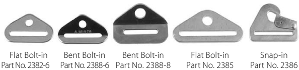
Flat Bolt-in Part No. 2382-6 Bent Bolt-in Part No. 2388-6 Bent Bolt-in Part No. 2388-8 Flat Bolt-in Part No. 2385 Snap-in Part No. 2386

Bolt-in End Plates Available either flat or bent with \frac{3}{8} " or \frac{1}{2} " mounting hole.