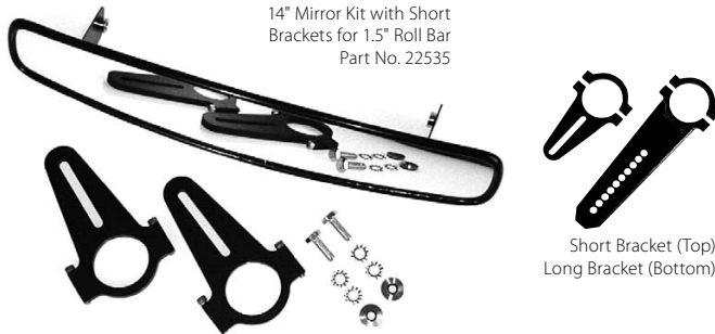
14" Mirror Kit with Short Brackets for 1.5" Roll Bar Part No. 22535