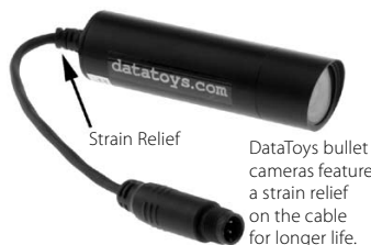
DataToys bullet cameras feature a strain relief on the cable for longer life.

The Multi-View Quattro Video Processor mixes up to four video channels into a single output channel. The four channels can be arranged in any of 38 different picture modes (Picture-in-Picture, split screen, etc) and the built-in 2-axis accelerometers and clock have 13 different settings. If you will be using only 1 camera, you do not need the Multi-View Quattro unit. If you will be using 2 cameras, you can either record them as separate channels with the XM-DVR Pro alone, or you can mix them into one picture with the Multi-View Quattro. Systems with 3 or more cameras require the Multi-View Quattro.