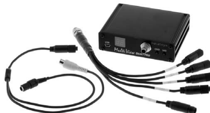
Left: Multi-View Quattro Video Processor Part No. 9750-610 Allows many different Picture-in-Picture options. Includes AV cables to connect up to 4 DataToys bullet cameras.

Single Bullet Camera Kit (no recorder) ..... Part No. 9750-660 .... $299.99 Includes waterproof 580 line bullet camera, 2 mounts with camera cradle, amplified microphone, and a 2-meter extension cable. Recorder sold separately. NTSC format for use in North America and Japan. PAL cameras are also available through our website.