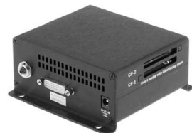
Above: XM-DVR Pro Digital Video Recorder Part No. 9750-600 Kit includes AC and DC adapters, wireless remote control, USB cable, and AV cables.