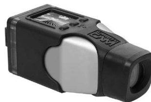
AiM SmartyCam Part No. MC-540

AiM SmartyCam Kit ..... Part No. MC-540 ..... $999.00 Includes camera mount, CAN cable for connection to AiM data loggers (can be modified for connection to vehicle power), USB cable, AC charging adapter, 4GB MicroSD card, and SmartyManager software.