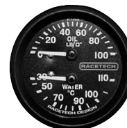
Oil Pressure/Water Temp. Part No. 1094-xx