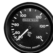
140°C Oil Temp. Gauge Part No. 1093-xx