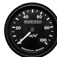
100 psi Oil Pressure Gauge Part No. 1091-100psi

These hose ends have a flat sealing surface for Racetech (or Smith's) pressure gauges. See page 85 for PTFE hose.