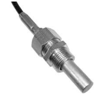
Typical temperature sensing bulb with 3/8 BSP adapter

If you don't want to use a plastic tubing kit to connect Racetech pressure gauges, we now stock special reusable hose ends for size 3 Stainless Steel Braided PTFE Hose!