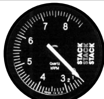
Part No. ST400-0-3-8500

Series ST400 Professional Tachometers incorporate microprocessor controlled stepper motor movements for "no waver" operation throughout the rpm range. This technology also permits the dial to be compressed at the low end and expanded at the top end for more accurate reading in the engine's normal operating range. All models include 25 minute recording for on-tach playback, a tell-tale function, panel mount shift light, switch kit, wiring harness, and complete instructions. Backlit dial for night use. Mounts in an 80mm (3 1/16") opening (bezel diameter is 3.47"). ST430 (5" diameter) is also available via special order. When ordering, please specify RPM range from the chart at right.