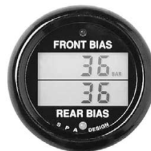
Panel Mount Bias Gauge with Sensors Part No. DG205

Detail of Brake Line Interface Module with Bleeder (two included with gauge) Adapter fittings not included. This item comes with 3/8"-24 flat face female ports only. See pages 86 and 87 for the appropriate adapters and crush washers.