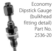
Economy Dipstick Gauge (bulkhead fitting detail) Part No. 2536-20

Standard Fuel Cell Pickup Use to add a second pickup to a cell. These can be installed by drilling an extra hole in the fill plate and installing the included bulkhead union.