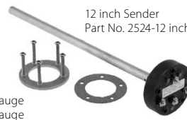
12 inch Sender Part No. 2524-12 inch