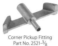
Corner Pickup Fitting Part No. 2521-3/8