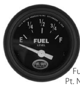
Fuel Level Gauge Pt. No. 2524-Gauge