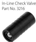
In-Line Check Valve Part No. 3216